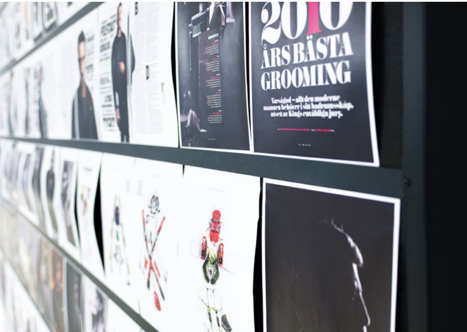
COLLAGE is the versatile adsorbent for schools, kindergartens and offices. Photo: Egmont use COLLAGE for editorial storyboards.

AKUSTIKMILJÖ // ENVIRONMENT-FRIENDLY SOUND ABSORBENTS WITH FOCUS ON FUNCTION & DESIGN