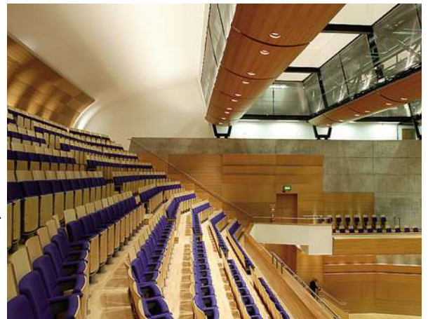
▲ Brighton Library Perth Concert Hall ►

Other notable TOPAKUSTIK installations were completed for the American School, Oxford and Cambridge Universities, the British Broadcasting Corporation, Imperial College of Science and Technology, The Royal Society and Canary Wharf Tower in Docklands, London.