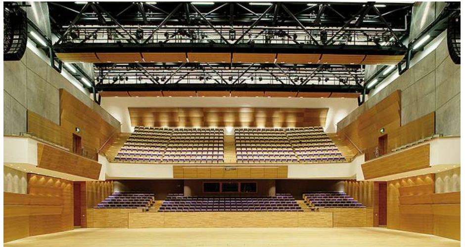
▲ Perth Concert Hall