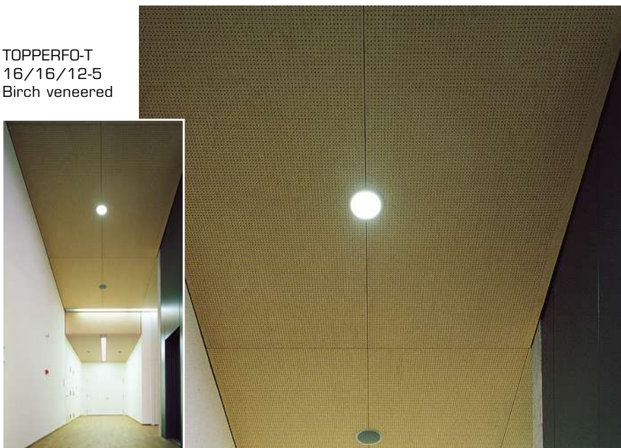
TOPPERFO-T 16/16/12-5 Birch veneered

The photograph below shows Topperfo-T with 5 mm diameter face perforations. Compared to the standard 8 mm diameter Topperfo-M perforation this is still a discreet option. Topperfo-T is also available in smaller diameter 3 and 4 mm face perforations.